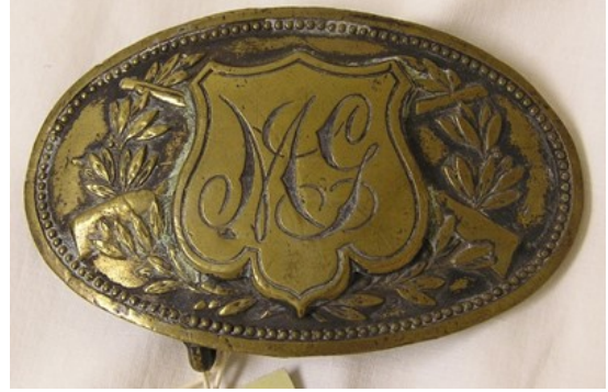
This brass belt buckle is part of the Sutter collection acquired by MCHS in 1929.

The artifact profiled in this spotlight is the metal buckle shown at right. The "MG" engraved on the front