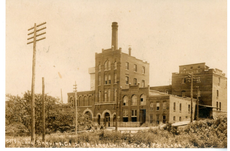
Highland Brewing Company in Highland, Illinois. (MCHS)

Sometime around the turn of the century, a third floor