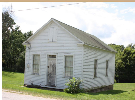
The old Village Hall as it appears today. Notice the unusual eaves. (Reinhardt)

The board approved an expense of $300 to convert part of this new village hall into a jail. The building, which still exists today, was used as a seat of government until 1996