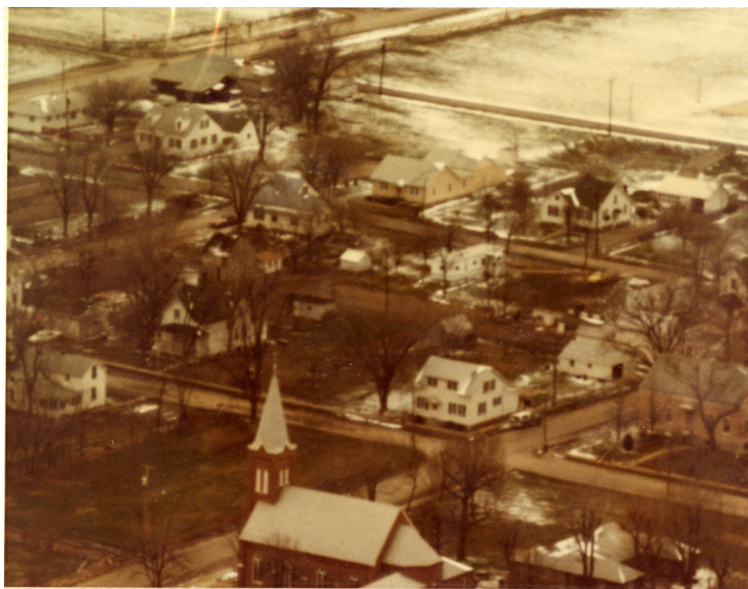
Above is an undated view of northwestern Grantfork. Of note is the Catholic Church seen in the foreground and the John Bardill house on the right, across John Street. The John Bardill family donated land for both Catholic & Protestant churches in Grantfork. The Catholic Church is located on what is labeled "Public Square" on the plat shown on page 4. (MCHS)

But the village still had a bit of an identity crisis. Although the post office was now Grantfork, the name of the Village was not officially changed at that time. After 1870 the local newspapers all reported "Grantfork" news, but the old name of Saline was used on county and state documents until it was officially changed to Grantfork in 1917. The 1840 plat shows the village is located in Saline Township, but the later plat of 1866 extended into Leef Township with the village's Main Street marking the divide between the two townships.