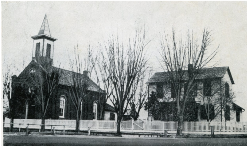
Grantfork's first churches, both established in 1872, were the Lutheran Evangelical Church shown above (1872 building) and a vintage photo of St. Gertrude's Catholic Church's 1904 edifice.

Cemeteries were established by both Grantfork churches, the Protestant cemetery in 1878 and the Catholic cemetery in 1874.